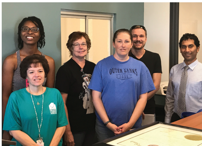
Our Baltimore County team is settling into bright, new digs!

With more staff specialists and a new, welcoming space, clients will have access to the respectful, timely and comprehensive care they deserve.