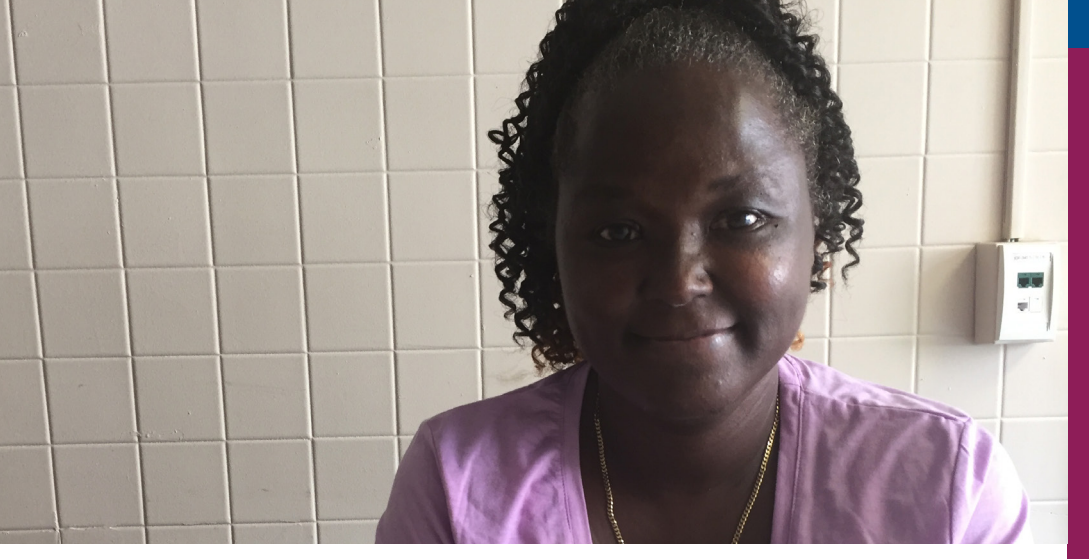
Jackis is a role model for all of us working to keep our diabetes in check.